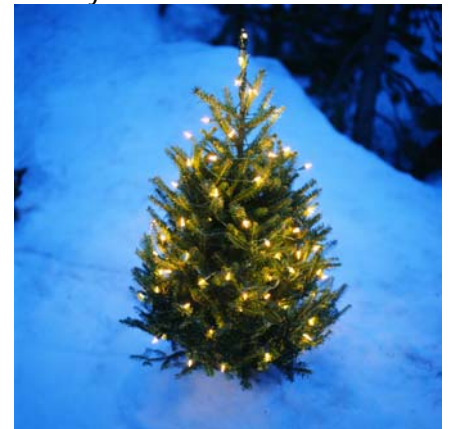
Best Holiday Wishes to all