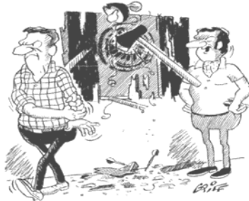
○ "Temper, temper — you can't expect to win every time!"